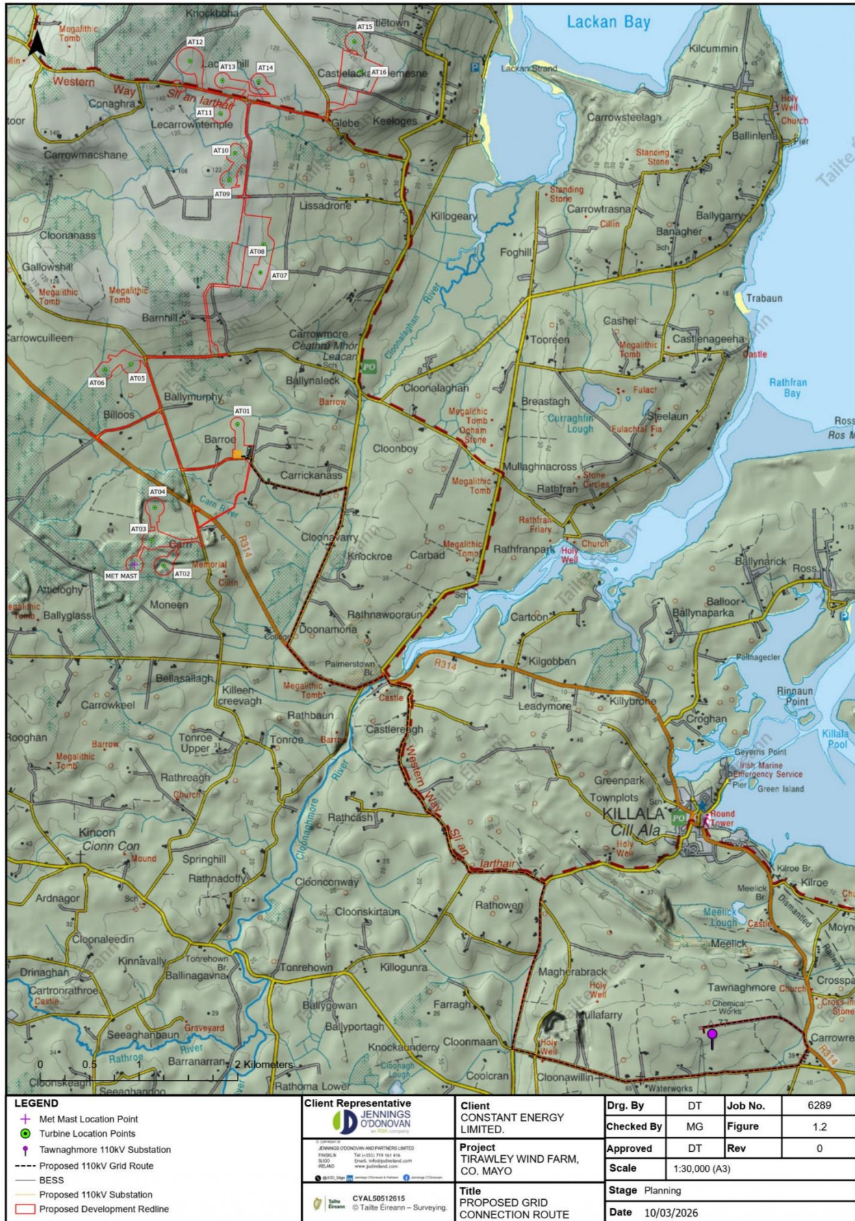
Figure 2.1: Tirawley Wind Farm Grid Connection Route